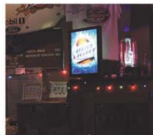
Bar & Grills